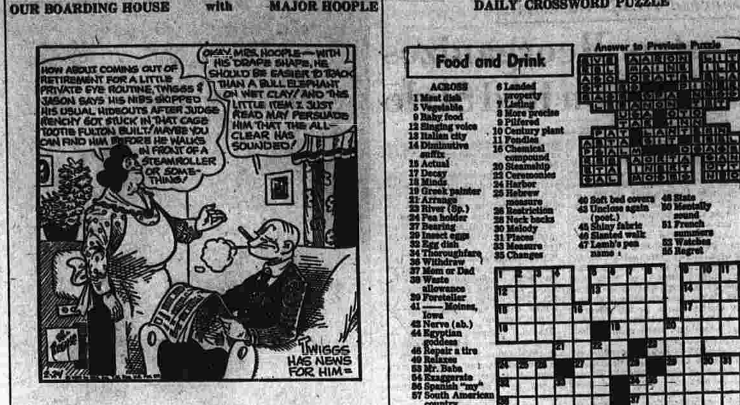
OUR BOARDING HOUSE